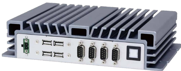
BPC-3040-1A1 front I/O

Fanless Embedded Box PC with Intel® Apollo Lake Pentium® N4200 Processor, Support -20~ 70°C Operation Temperature